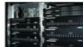
Slim profile for rack mounting