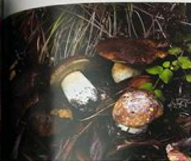
140. Boleter annus (Queen Bolete), p. 526. Cap is dark brown, almost a black bloom when young; cinnamon-brown or paler when