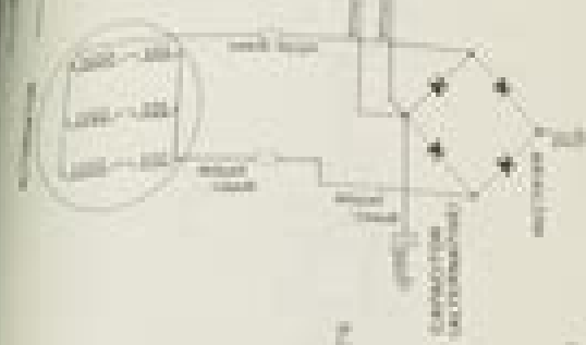
Fig. 3. Generator and battery connection.