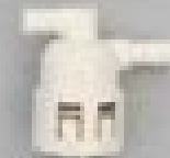
Fuel pressure regulator