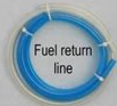
Fuel return line