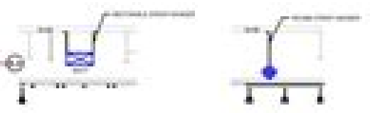
① RECTANGULAR DUCT HANGER DETAIL ② ROUND DUCT HANGER DETAIL