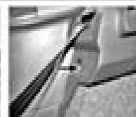
1.19 ... and the one (arrowed) at the front