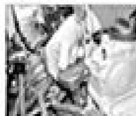
1.17 Remove the 10% valve (underneath) from the timing cover