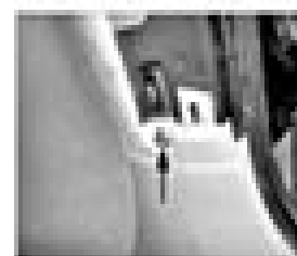
1.21 ... the one (arrowed) at the top