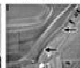
1.33 ... unscrew the bolts (arrowed) at the base of the panel