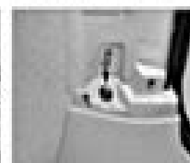
1.32 ... and the bolt (arrowed) at the top