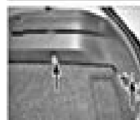
1.18 Unscrew the bolts (arrowed) at the rear of the panel (left support)