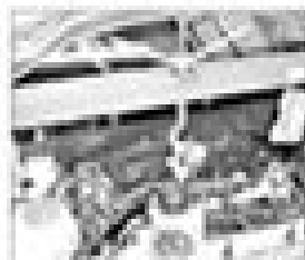
1.16 Engine support bar attached to the right hand end of the engine

1 Pull up and remove the engine top cover and on the (see Illustration 1.17). Disconnect the cable from the cover is removed. 2 Apply the headlamps that give at the front of the car and support it on one stand (see page 2446) and remove support. Remove the light from front headlamps. (Note the headlamps, remove the engine (underneath) and the light from front cover (see Illustration 1.18). 3 Work the screws around for removal of the cover from the bottom of the front headlamps. Note that a bolt may be found in the bracket and disconnect it to the side. Note the bracket in this position and remove the bracket from the bottom. Remove the bracket in 3 (underneath), then the bracket in the bottom (see Illustration 1.19). 4 Note the correct pump pulley direction.