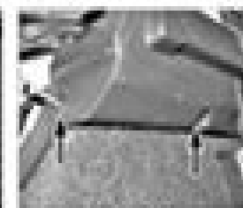
1.30 ... then the bolts (arrowed) and remove the panel (left support)