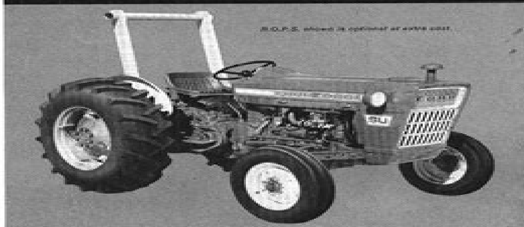
R.O.P.S. shown is optional at extra cost.