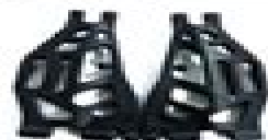
R/Lower Susp.Arm (L/R). 2P