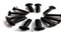
Flat Cross Screw (1/2 x 10). 12P