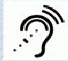
Assistive listening devices