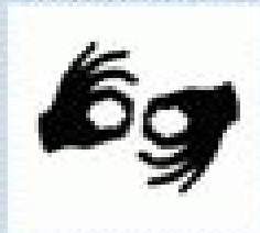
Sign language interpretation provided