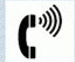
Volume control telephone