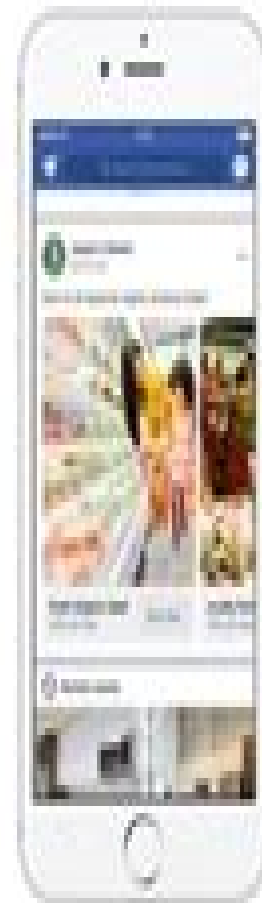
Facebook Marketplace (Desktop & Mobile)