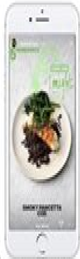
Facebook Stories (Mobile)