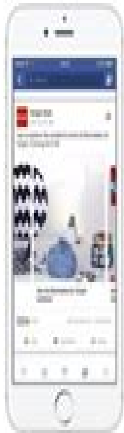
Facebook News Feed (Desktop & Mobile)