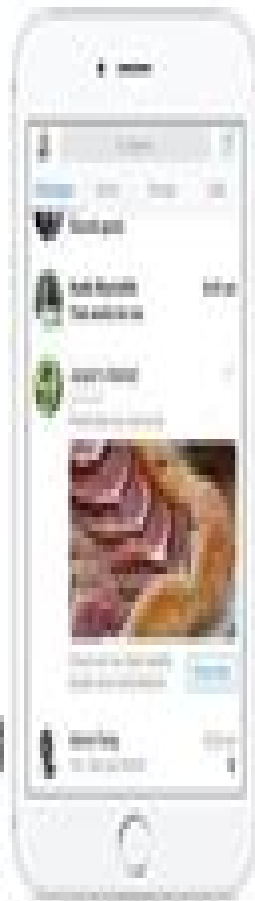
Facebook Messenger App (Mobile)