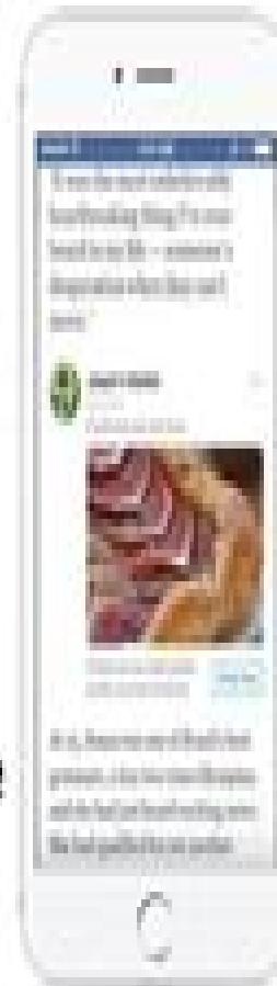
Facebook Instant Articles (Desktop & Mobile)