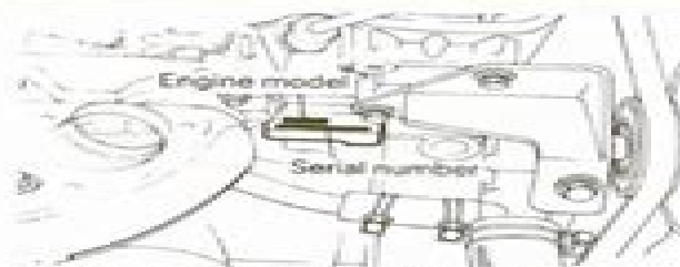
On 2.6L four-cylinder engines, the identification number is located on a machined surface at the right front corner of the block, just below the cylinder head

The engine ID number consists of two parts: a model number and a serial number. On four-cylinder engines, it is located on the right side of the engine in one of two places: 1) on a machined surface at the front corner of the block, just below the number one spark plug (2.6L engine) or 2) at the lower right front corner of block (2.0L and 2.4L engine) (see illustrations). On V6 engines, the ID number is located on a pad at the right side of the block (see illustration).