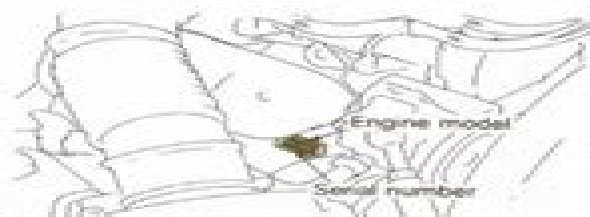
Location of the identification number on 2.0L and 2.4L four-cylinder engines