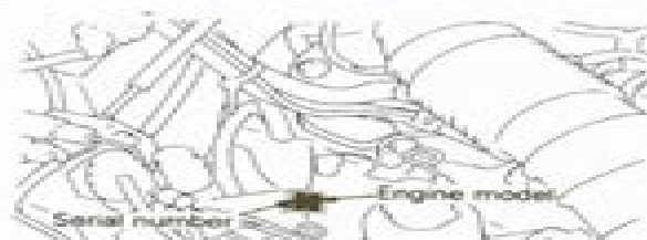
V6 engine ID number location