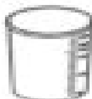
Language Technology Group 17th Floor