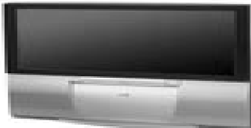
Illustration of AV-56P777 and AV-48P787