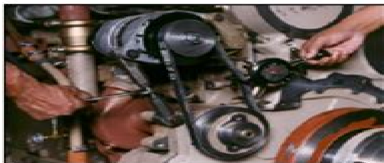
Fig. 4-2. Checking belt tension with GT-1138