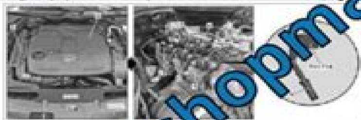
Fig. 2. Identifying Crankshaft Reverse Install Components - Shows On Engine 204.077