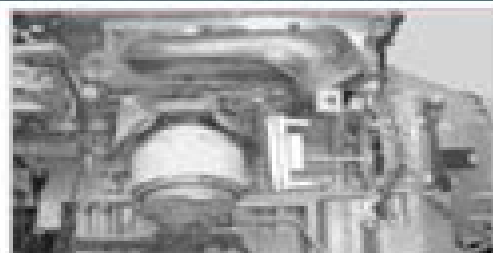
Fig. 46. Identifying Rotating Lock For Crankshaft Ring Gear Reverse Install Components