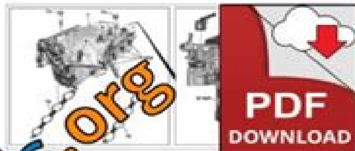
Fig. 47. Identifying Rotating Locks, Mainshaft Reverse Install Components (1.07.0)