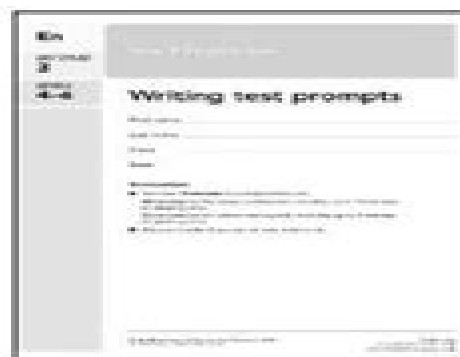
Writing test prompts