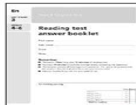
Reading test answer booklet