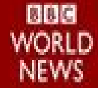
BBC WORLD NEWS