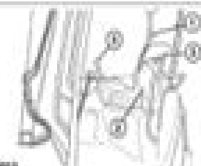
1. Boom Rest