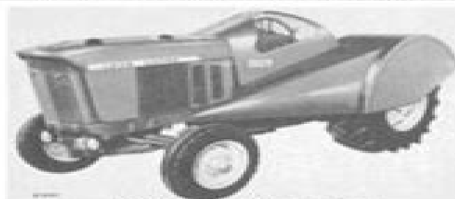
John Deere 3020 Orchard Tractor