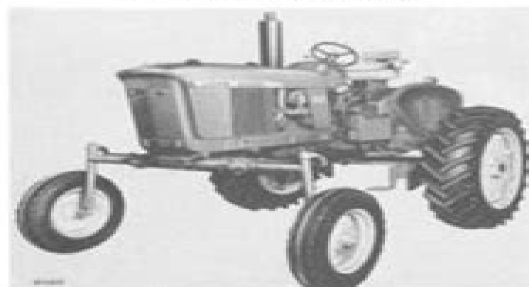
John Deere 3020 Hi-Crop Tractor