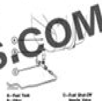
4-Fuel Tank Sump