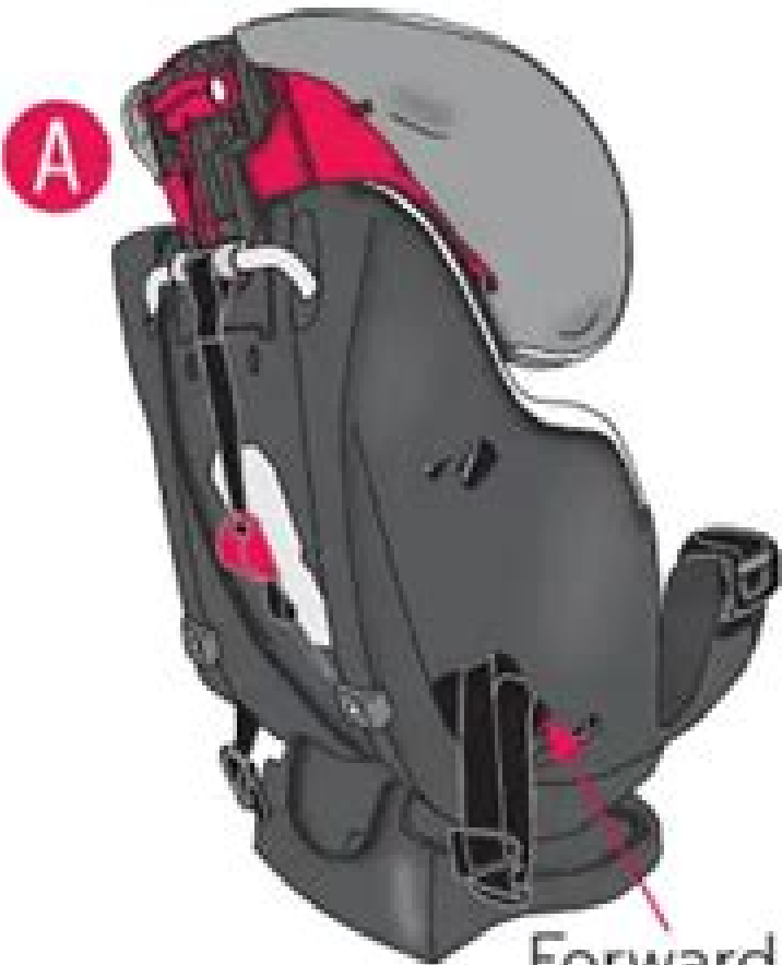
Forward-facing Belt Path