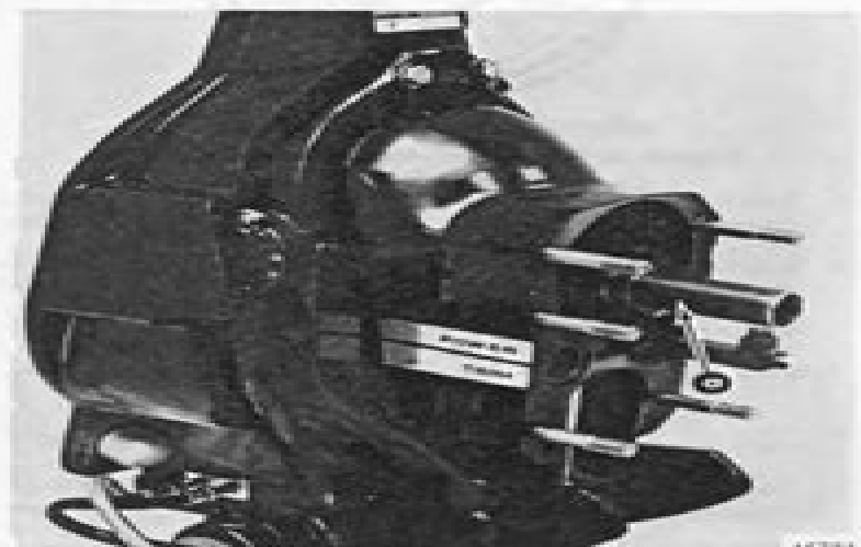
a - Alignment Shaft