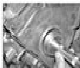
15.13 ... and using a drift to keep it square. Tap it into the cover

note that the timing belt must have been removed. 8 Tight the crankshaft pulley as described in Section 4.