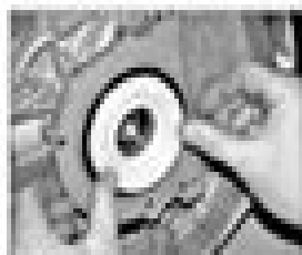
15.12 Fitting the seal footings with plastic shims in position

draw out the oil seal footings to fit that position.