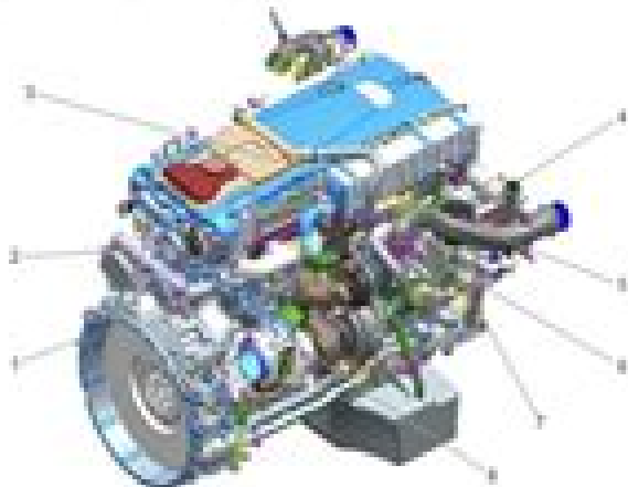
Fig 1.1. D04 Right Side View