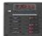
Blue Sea 3002 / 3003