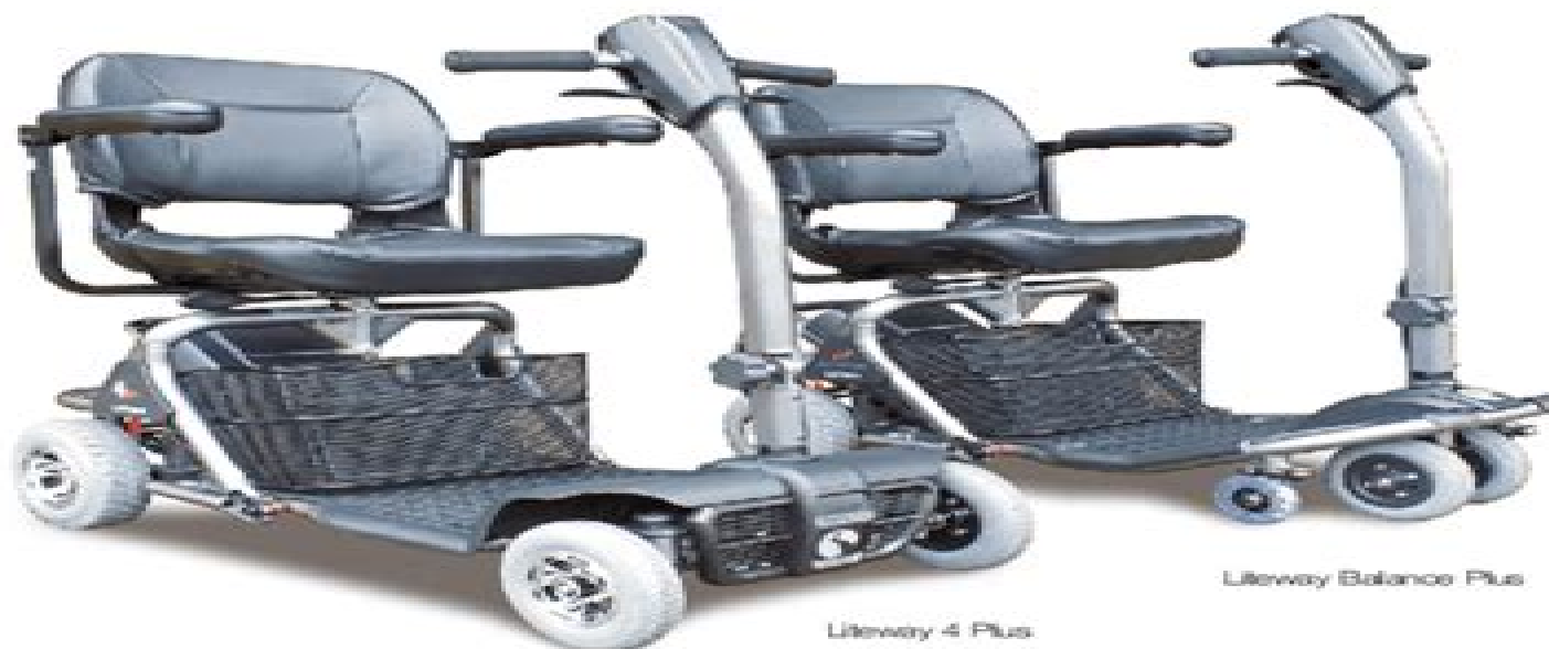
Liteway 4 Plus