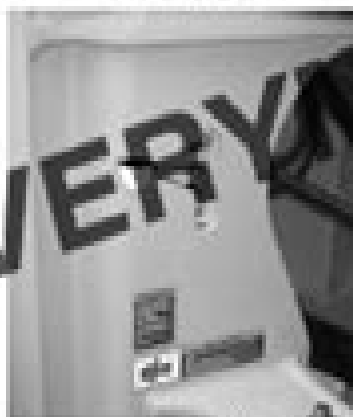
3 Power, Left Side View

Lubricate every 10 hours when operating in severe conditions such as deep track, water, or snow.