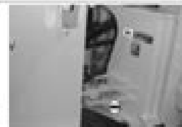
4 Front, Right Side View

Lubricate daily when operating in severe conditions such as deep track, water, or snow.