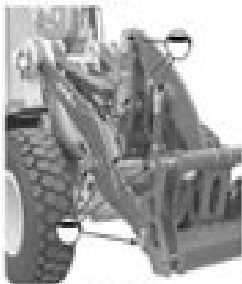
1 Power, Right Side View