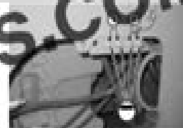
5 Rear View

Lubricate daily when operating in severe conditions such as deep track, water, or snow.