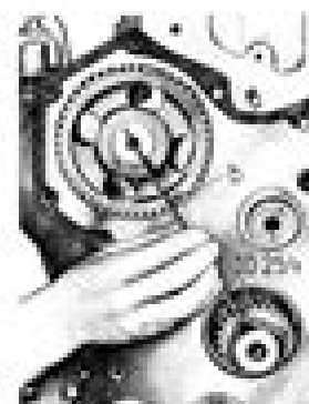
Fig. 11 - Timing Camshaft Gear by Means of Timing Tool No. 42154