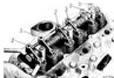
Fig. 8 Adjusting Clearance of the Intake Valve of Cylinder No. 1

1. Pusher 2. Adjusting screw of intake valve 3. Adjusting screw of exhaust valve