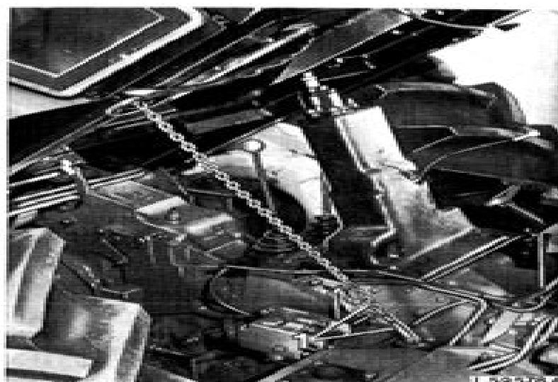
Fig. 17 — Cab Retaining Chain Installed

By means of hand winch slowly tilt cab to the rear until cab is over center and retaining chain is under tension (see fig. 17).