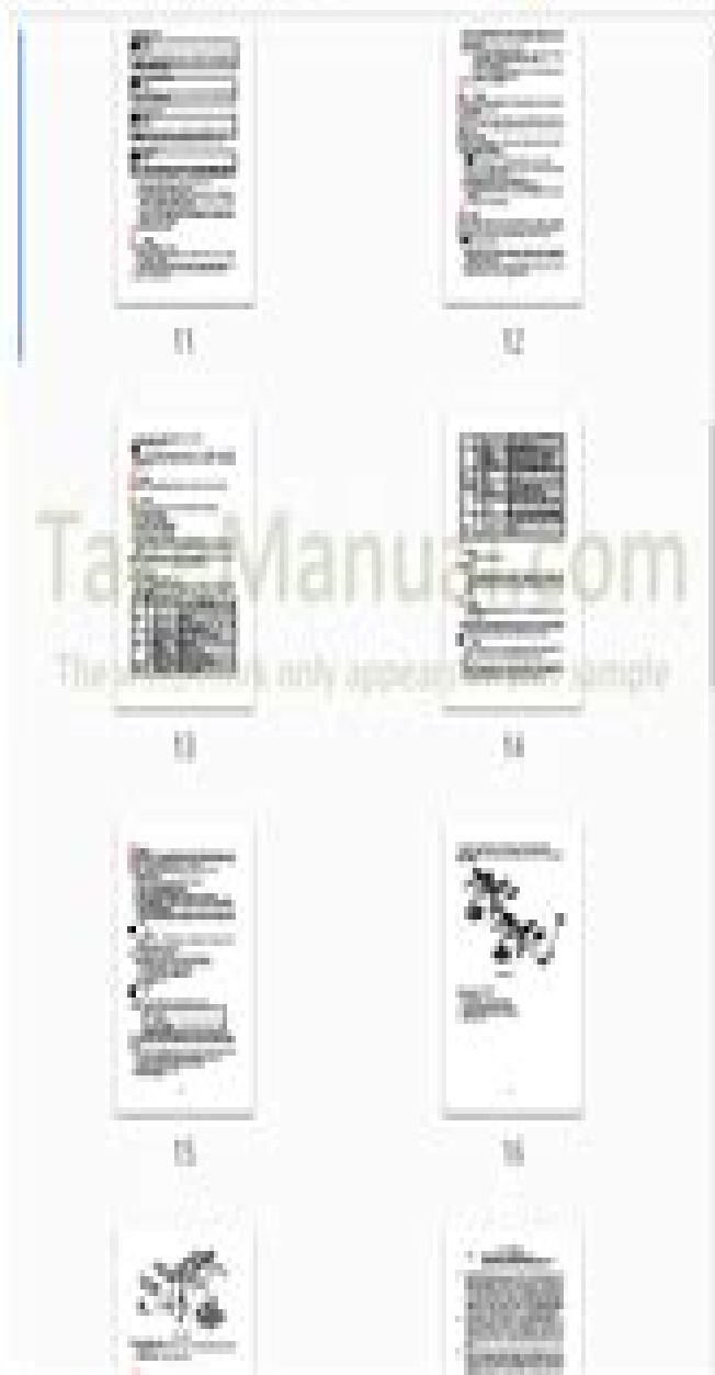
1.2 Plan technical parameter (20.00% Electric Pallet Truck)