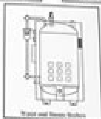
Float and Inflow Solenoid