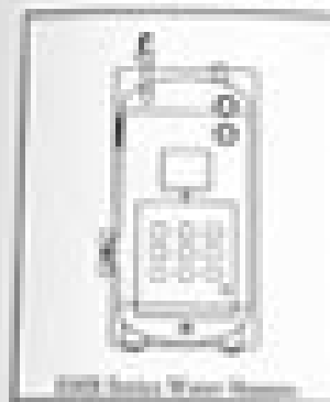
200 Series Float Valve

Float Valve Models (Series 200 & 210) and Float Valve & Inflow Solenoid