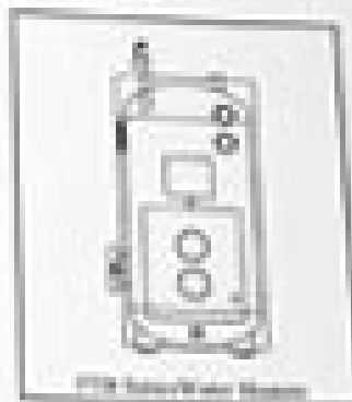
210 Series Float Valve