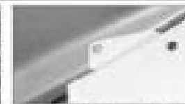
2-7: Removing the radiator from the top of the radiator.