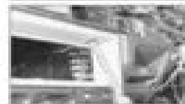
2-6: Removing the radiator from the top of the radiator.