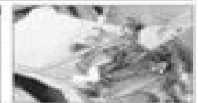
2-8: Removing the radiator from the top of the radiator.

2-9: Removing the radiator from the top of the radiator.