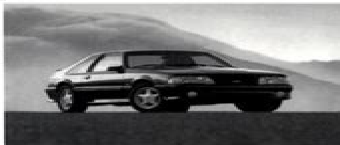
1993 Mustang

Since it was based of the successful Fox Body chassis that includes the Fairmount and the Thunderbird, this allows the 1979-1993 Mustang to share with its older siblings, which is a great benefit to Mustang owners. When the car was new, the sharing allowed Ford to keep the price down, and today gives a bigger choice of parts, but which ones? With Mustang GT Parts Interchange , you will.