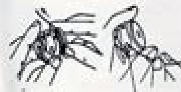
Abertura da fenda

*Puxe a linha para a esquerda, por baixo da mola de tensão, até que entre na abertura da saída.