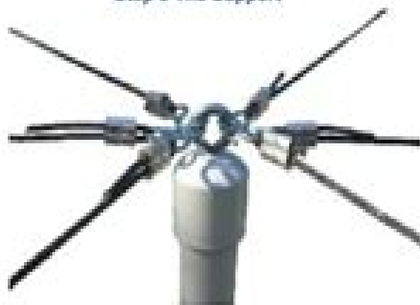
Step 5 The Support