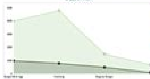
SALES BY ITEM