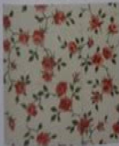
21. Floral pattern, 1920s 22. Floral pattern, 1920s 23. Floral pattern, 1920s 24. Floral pattern, 1920s 25. Floral pattern, 1920s 26. Floral pattern, 1920s 27. Floral pattern, 1920s 28. Floral pattern, 1920s 29. Floral pattern, 1920s 30. Floral pattern, 1920s

The design studio is a place where the designer can experiment with different materials, colors, and patterns to create a design that is unique and original. The design studio is a place where the designer can experiment with different materials, colors, and patterns to create a design that is unique and original. The design studio is a place where the designer can experiment with different materials, colors, and patterns to create a design that is unique and original.