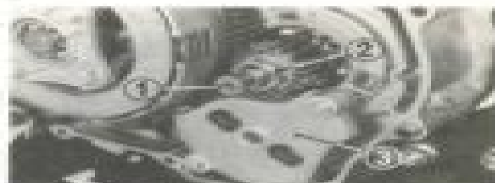
Fig. 14 (13) Oil through pipe (11) 1/4 inch lock nut (10) Oil pump