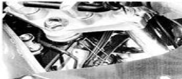
(1) The frame serial number is stamped on the right side of the steering head.