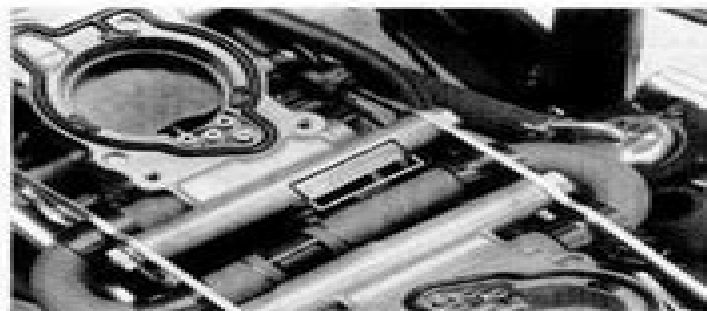
(3) The carburetor identification numbers are stamped on the intake side of the carburetor body as shown.