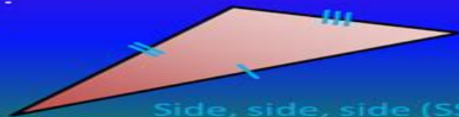
Side, side, side (SSS)