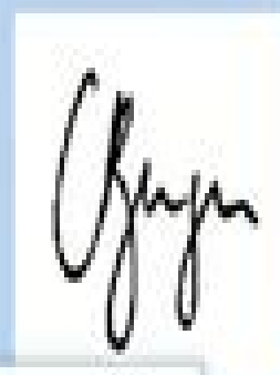
Applied threshold operation