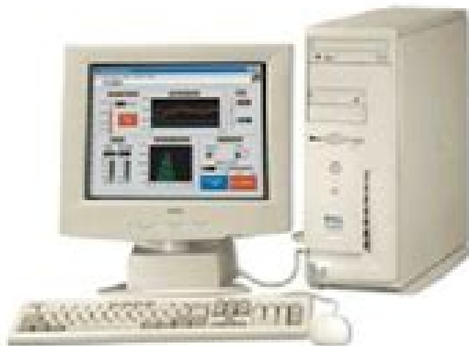
Computer running LabVIEW 8 and Windows 2000/XP