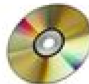
LabVIEW Basics II CD