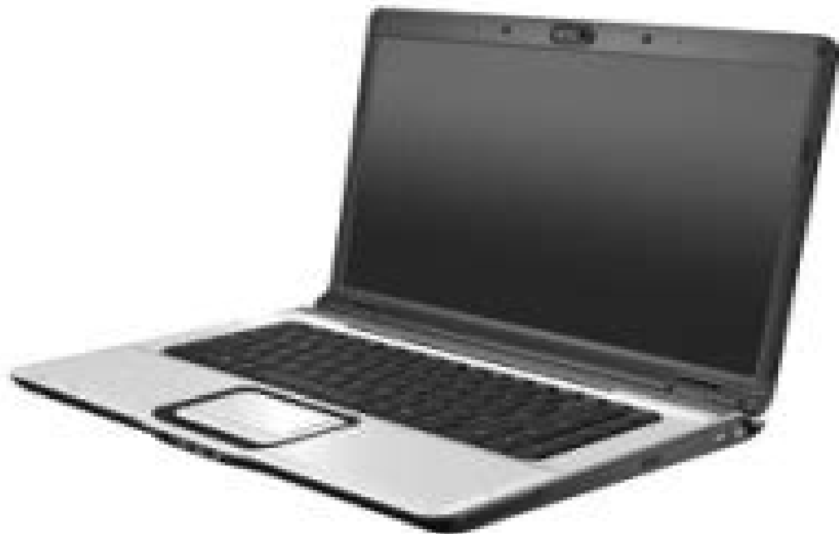
HP Pavilion dv6000 Notebook PC

The HP Pavilion dv6000 Notebook PC offers advanced modularity, Intel® Core™ Duo and Celeron® and AMD Turion™ 64 Mobile Technology and Mobile AMD Sempron™ processors, and extensive multimedia support.