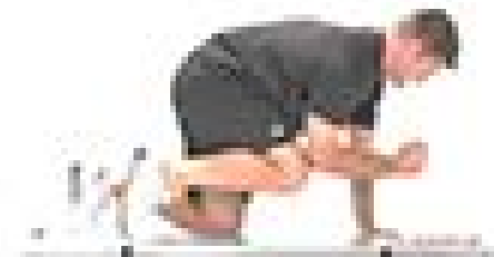
7. Rotary Stability