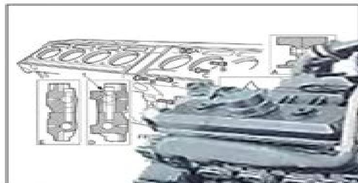
Figure 1-7 Separation of