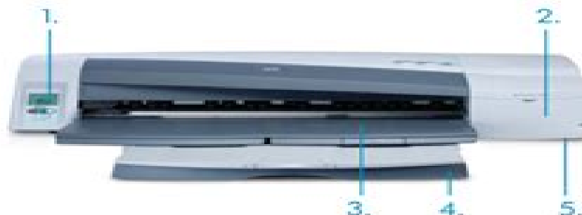
HP Designjet 110plus front shown