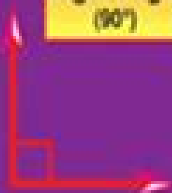
Right Angle (90°)