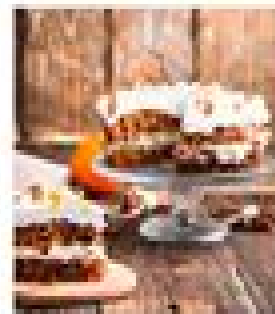
Crazy Good Carrot Cake