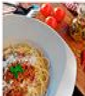
Classic Spaghetti Bolognese