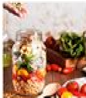
Cobb Salad in a Mason Jar