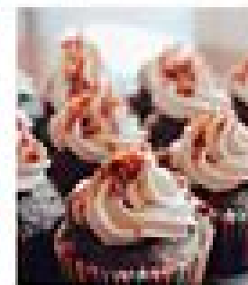
Chocolate Bacon Cupcakes with Map...