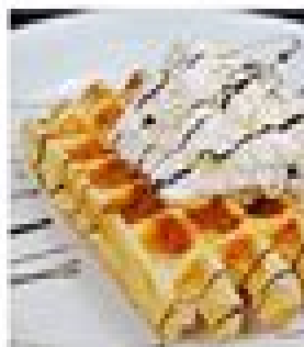
Belgian Waffles with Whipped Cream an...