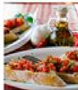
Bruschetta with Fresh Tomato and Basil