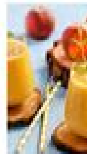
Creamy Peach Smoothies