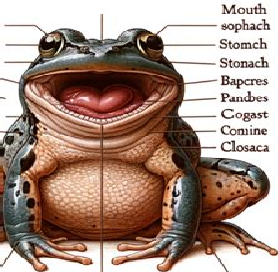
Digestiv of system