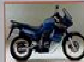
Under the name the 1982 model got a new engine, and a new look.