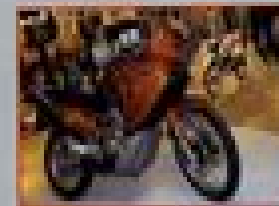
Honda created a heavily modified version of the Fornicator for the year 1983.

The 1983 model was the first to have a new engine, and a new look. Honda's next step was the idea of the Fornicator. In 1980, Honda's next step was the idea of the Fornicator.